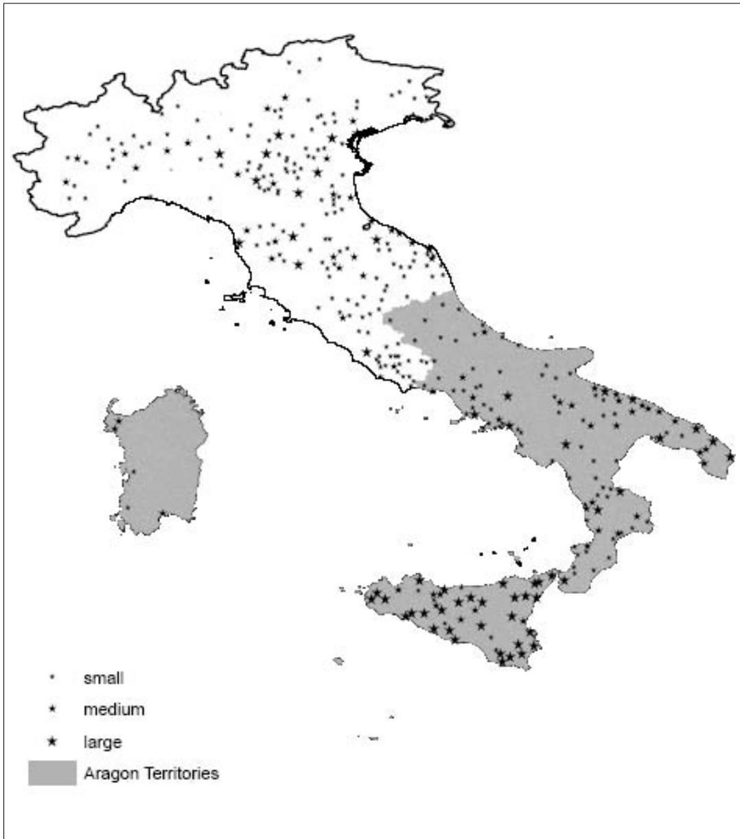
Figure 2: Jewish communities in 1450 A.D.